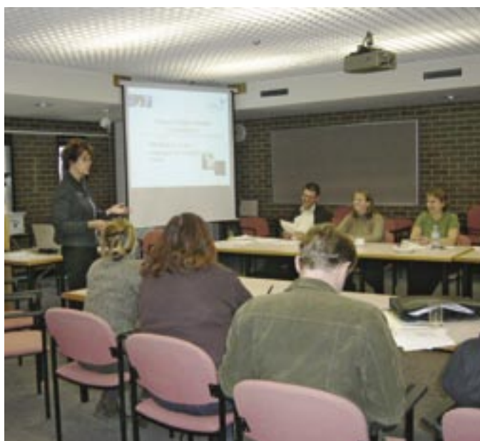
A group of students at a "Final Stages" workshop.