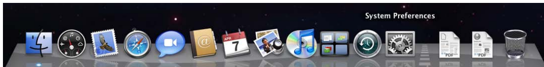
Mac desktop icons

There are some differences between versions of OSX, but the general actions you take to set the proxy will remain the same.