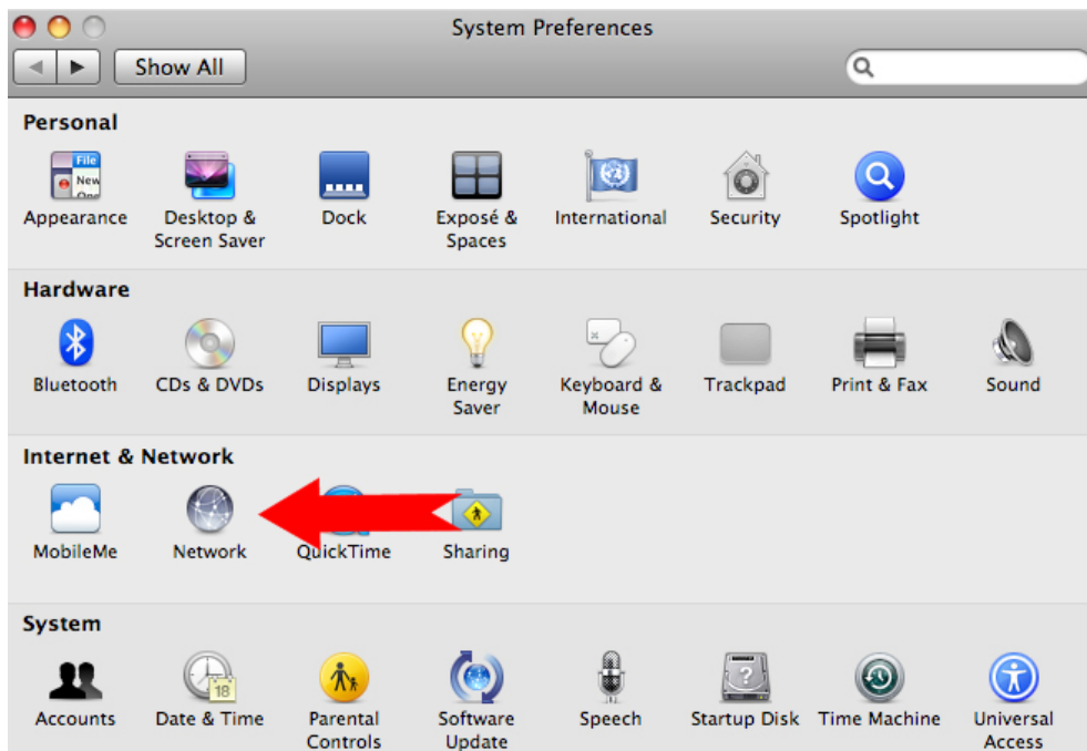
System Preferences screen

Login to your Mac and open System Preferences .