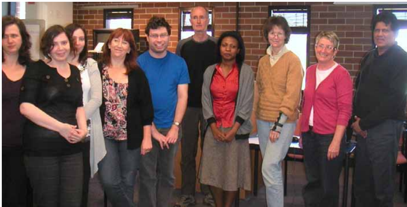
Final Stages Participants at Ward Library.

The Office of Research Services and the Student Learning Unit held a workshop on the final stages of candidature. These workshops are offered every session and cover editing, last stages of writing, the administrative process of examinations, examiner choice, managing the personal, professional and the political in the final stages, timelines, the abstract and any other questions that participants may have about examination.