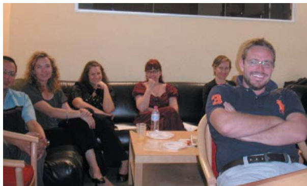
SoCA Staff and students at the 2011 Welcome