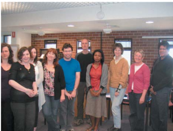
Students at a Final Stages Workshop