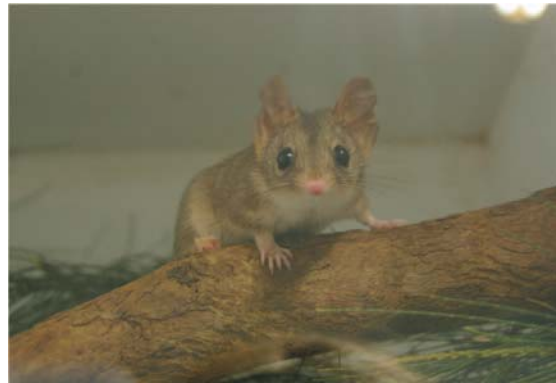
A Red Tailed Phascogale

The order Dasyuromorphia (meaning "hairy tail") comprises most of the Australian carnivorous marsupials, including quolls, dunnarts, the numbat, the Tasmanian devil, and the recently extinct thylacine. Hayley's work will go a long way to help conserve these important but vulnerable little animals.