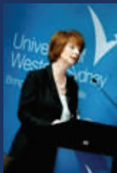
Acting Prime Minister Julia Gillard speaks at the official opening of the UWS School of Medicine building

“Home-grown doctors to meet home-grown needs”