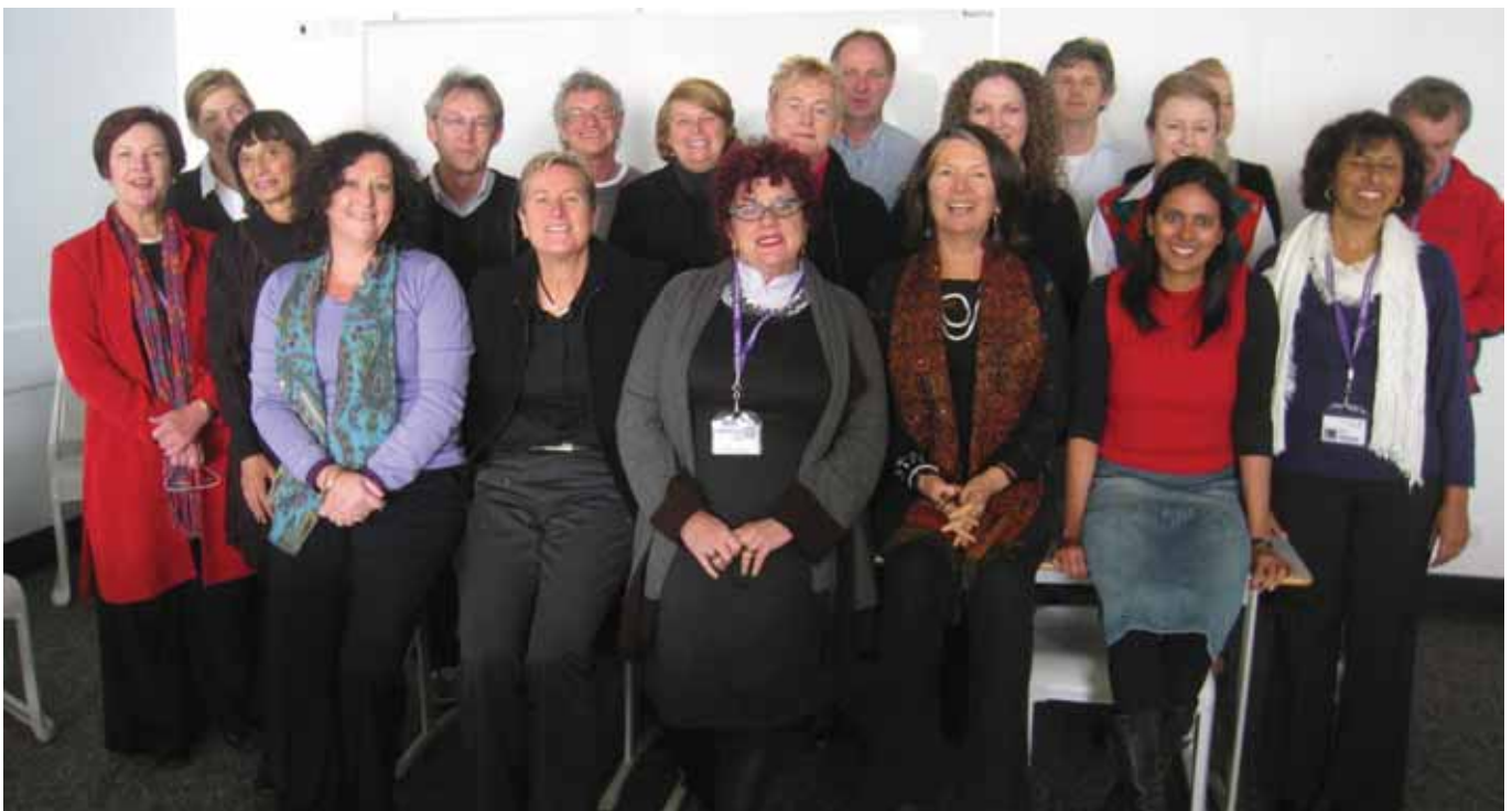
The first cohort in the new professional doctorate on cultural practices and ethics in schooling, offered by the Centre for Educational Research. All cohort members are senior education leaders from the South West Sydney region of the NSW Department of Education and Training, one of the country's largest school education regions, and part of the region's agenda to establish innovative, ethical, research-led practice in its schools.