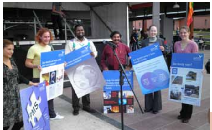
3 Minute Thesis presenters at Open Day exhibition