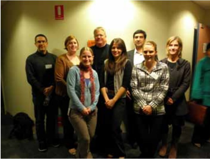
College of Health and Science 3MT participants