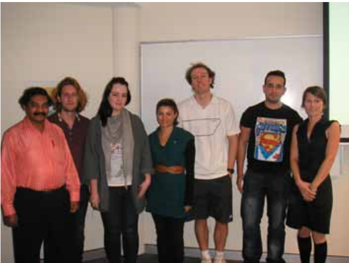
College of Arts participants