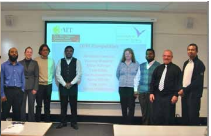
College of Business and Law competitors