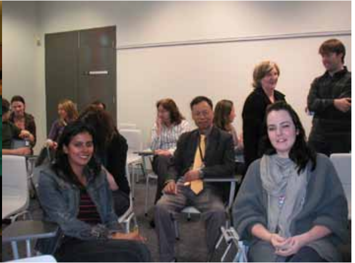
3MT College of Arts